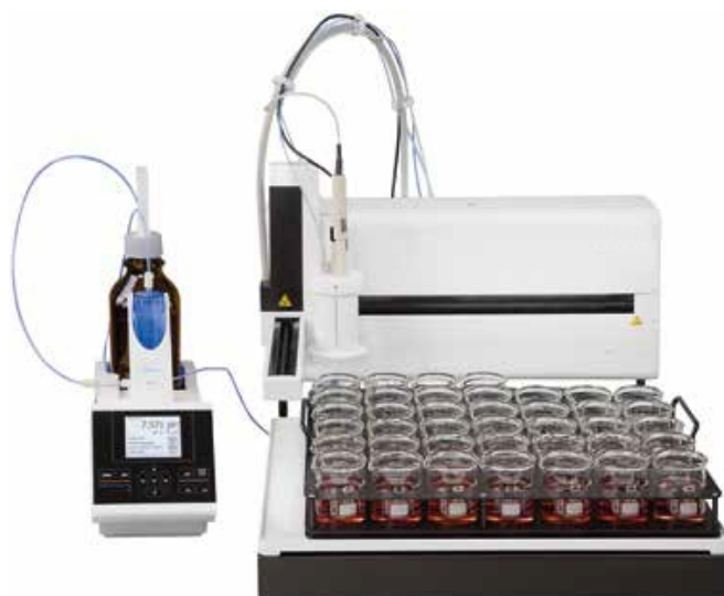
Titramax VT with connected autosampler for 42 samples