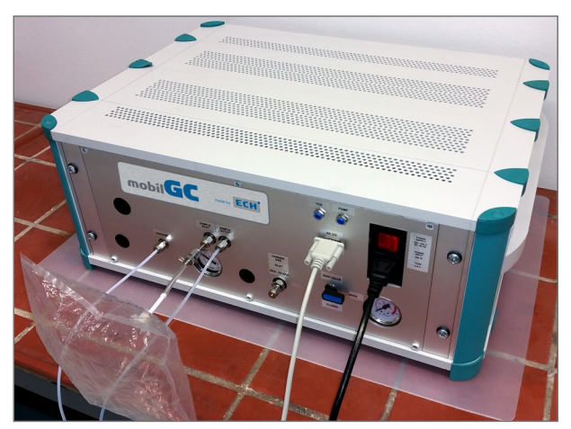
MobilGC with connected gas sampling bag