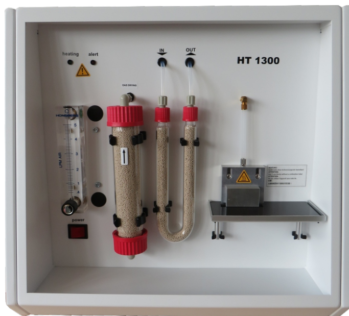
High temperature oven HT 1300 for Karl Fischer titrator AQUA 40.00

Due to the two-stage pre-drying of the inert transport gas in the integrated drying tower a very low background drift is achieved.