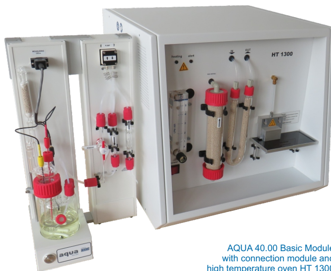
AQUA 40.00 Basic Module with connection module and high temperature oven HT 1300