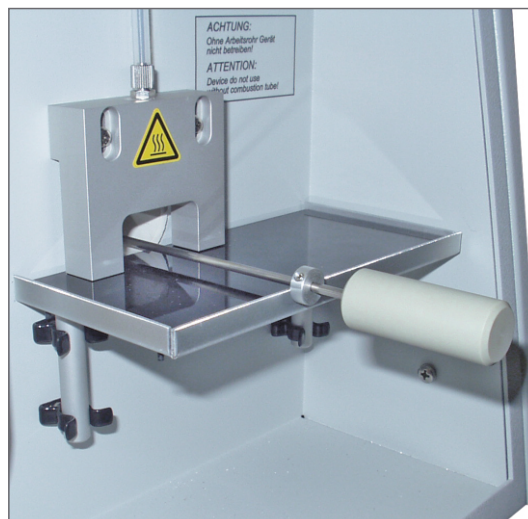
Sample dosing with boats of ceramic or quartz glass